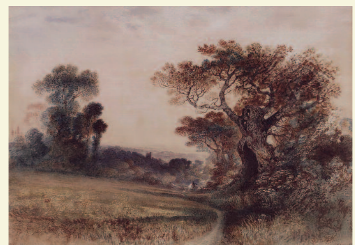
Figures on a stile 1840 John Martin Laing Art Gallery (Tyne and Wear Museums)

The John Martin Heritage Trail was developed as part of a community project in 2004, celebrating the life and work of John Martin. It was officially opened in April 2006. The trail is now funded and managed by Haydon Parish Council. The Council thank The National Trust for their continued help and support in managing the trail through their Allen Banks and Staward Gorge Estates.